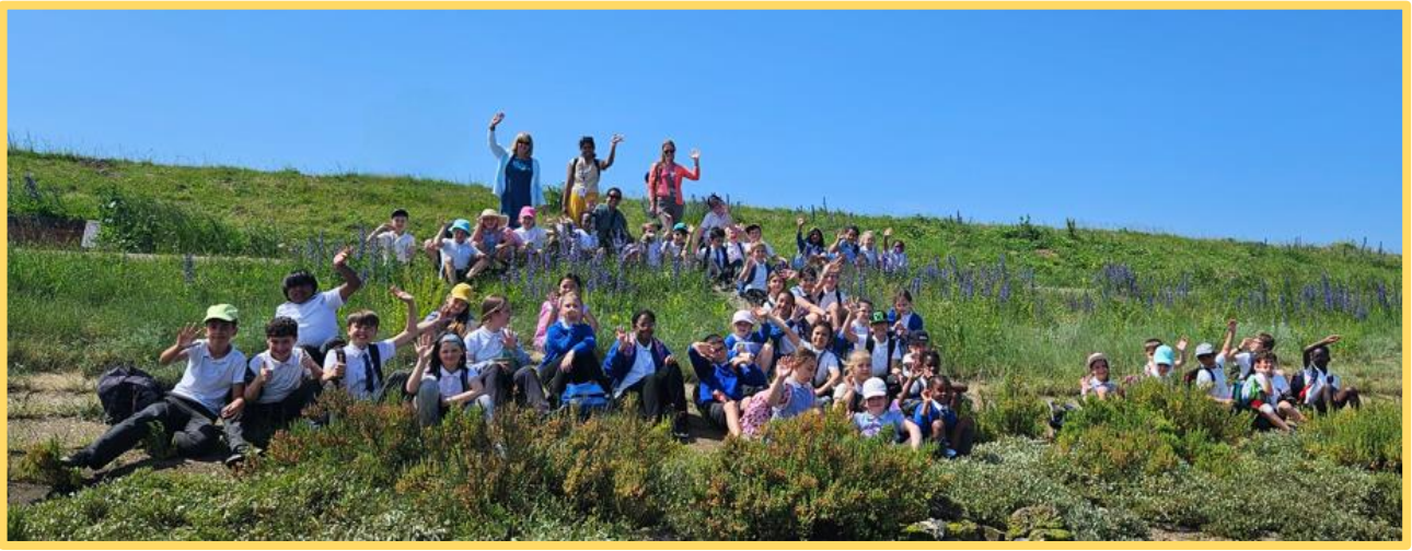
St Laurence's pupils enjoying ice-cream at Wells