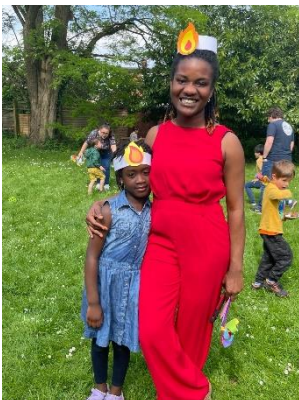
Photo from the children's Pentecost afternoon

It was like an earthquake – no, more like a stillness so complete – for me, more like the most perfect dawn all shell-blue and gold – for me, it was waking into heaven – or a wind blowing straight from God into the soul of me, between my eyes – I felt like I was inside a flame that did not burn but illuminated – I became a river's mouth, a spring bubbling, singing out God's Good News – more like feeling bigger on the inside, booming & echoing like a cathedral with praise bouncing, becoming, belonging – I found myself able to see others each with a flame of the Holy Spirit hovering – I could suddenly pray without distraction – it felt like flying, this joy, this being known – it felt like a cradling, knowledge of Love at last, Love strong & true & never ending – it felt like I had come into my purpose, discovering Christ & being discovered – for me, music exquisite, & I shone with swooping melodies, delicate chants – for me, the urge to heal, help, work: and I, I saw everyone as a child, needing the tenderness of God in Christ Jesus, heard the call, the Call, the words of God each morning encouraging my turning to see Christ standing waiting for me; in His Spirit I will glow, sacred to Him, living prayer, praise, wholly alive.