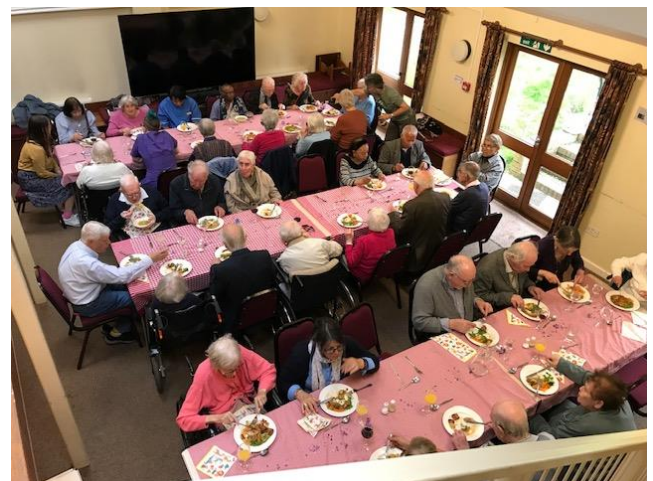
Senior Parishioners' Lunch