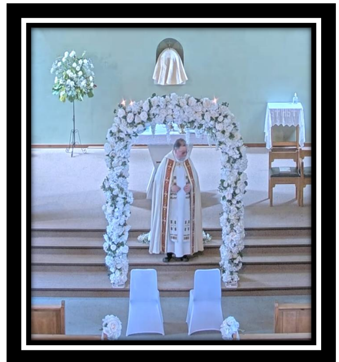
A wonderful wedding arch

How amazing that this should happen to two young Limerick girls, something so unexpected. Blessed by the Holy Spirit on such an occasion and the wonderful ways God moves in our lives.