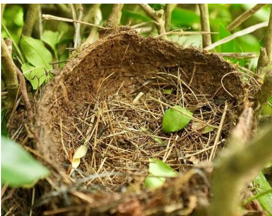
Empty nest, Torre, near Torbay

One might think there is nothing special about an old empty bird's nest, but that could be Coleridge's 'film of familiarity', eyes blinded 'to the loveliness and the wonders of the world'. The humblest, most obscure objects can be radiant with life. They contain something greater than ourselves.