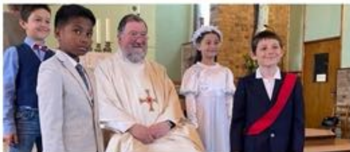
Some of our First Holy Communicants