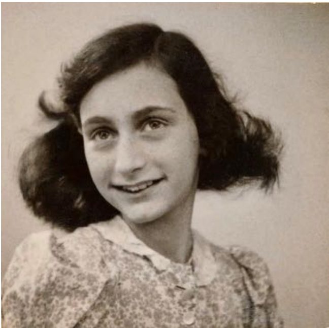
Anne Frank, May 1942