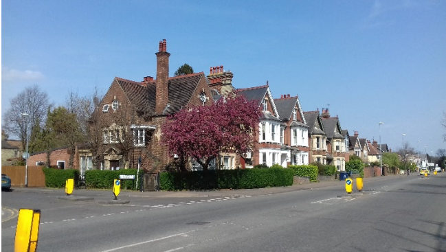
Polonia House, Chesterton Road

On behalf of the whole Polish community, I would like to express great gratitude for the warm hospitality and assure you of our prayers for all the faithful of St Laurence.