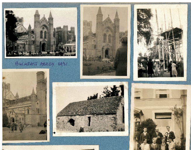
Buckfast Abbey, 1931, under construction