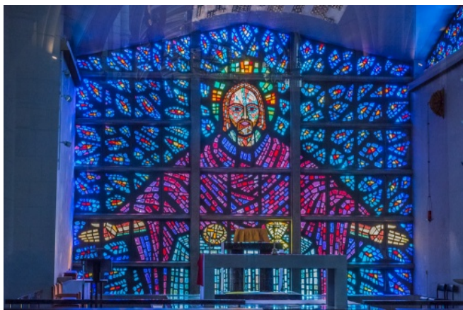
The East Window of the Abbey

The Abbey has visitors from all over the world. Among its many treasures is the hair shirt of St Thomas More now preserved in a side chapel.