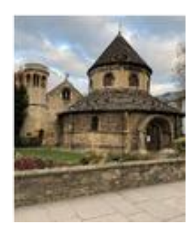
'Round church/ Church of the Holy Sepulchre