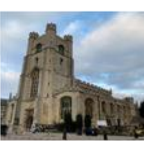
Great St Marys