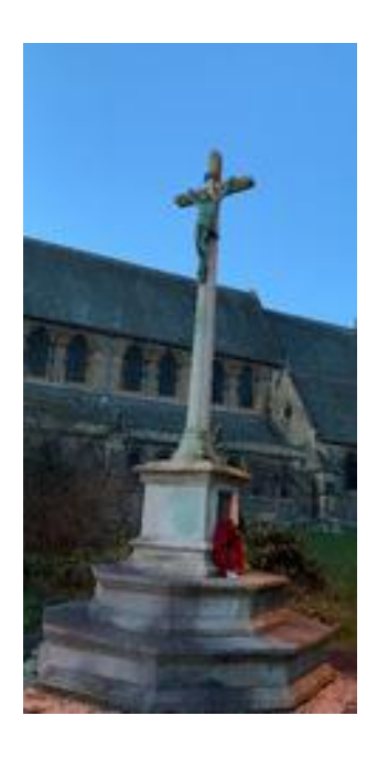
War memorial in St Giles churchyard